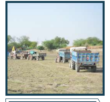
Transportation of the silt to farm lands with tractortrolleys.The transportation costs are covered by the farmers.