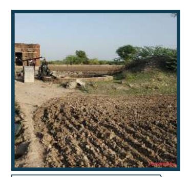
The silt is used by the farmers as on organic fertilizer on their land. There is more water storage capacity in the water bodies.